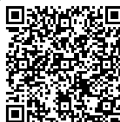
Application Form QR

Application Form Link: https://forms.office.com/r/jXxcafAg2g